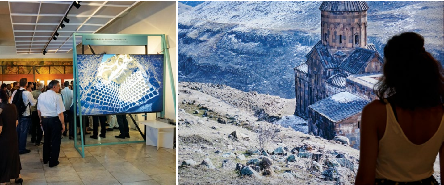
Figure 2. Ani exhibition in the Museum of Architecture of Armenia.

Similar projects were implemented focusing on Mush 9 and Artvin. This work has been done under the leadership of EPF's long-term partner Anadolu Kültür. The reports are being shared with the governments of Armenia and Turkey, UNESCO and other relevant institutions. Also, in 2017 EPF partners did a comparative assessment of the urban heritage of Gyumri and Kars 10 . The issues of Armenian architectural heritage in Turkey are at the constant attention of EPF 11 . In June 2018, the Ani exhibition by Anadolu Kültür was for the first time opened in the Museum of Architecture of Armenia, with support of EPF. This strand of work is usually funded by the European Union and Sweden.